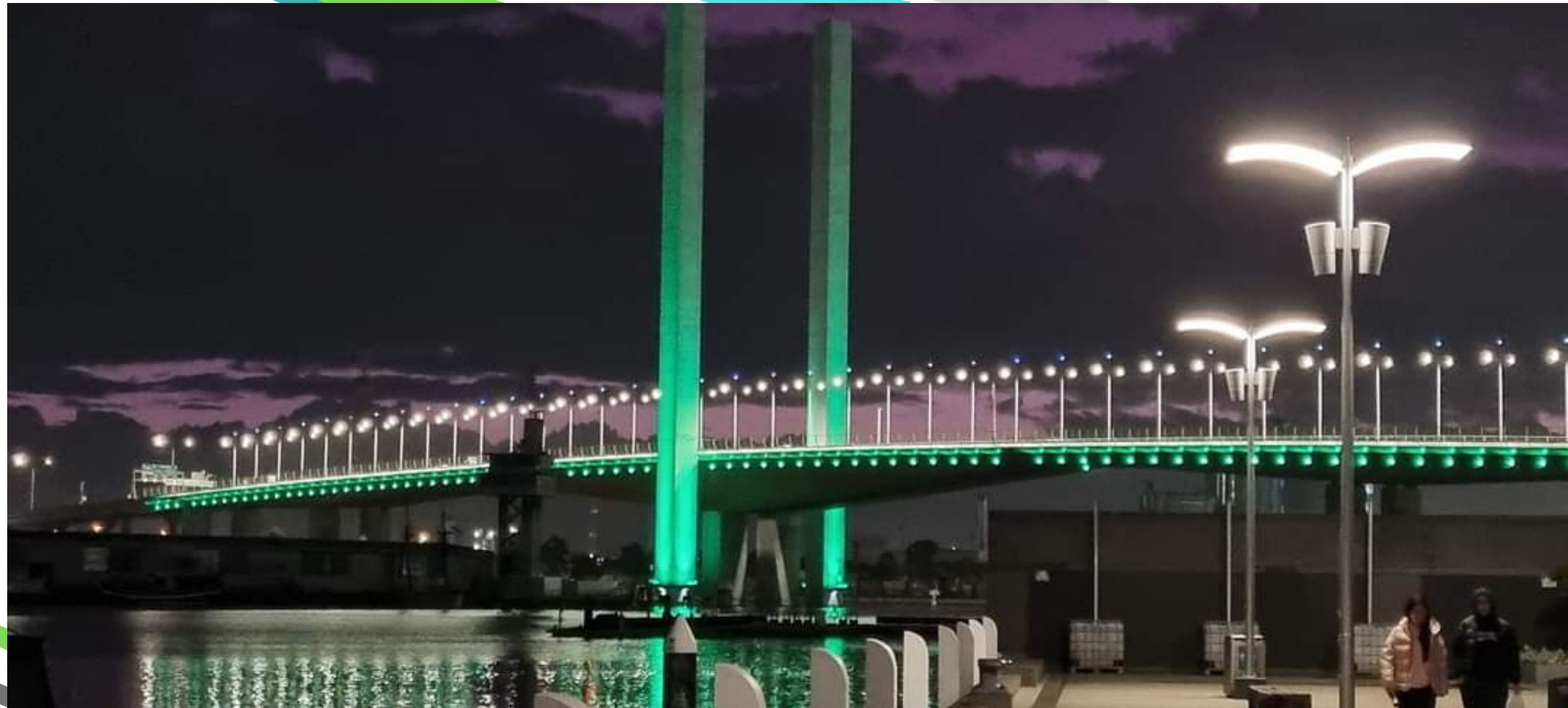
Bolte Bridge - Melbourne (Karen Katz)